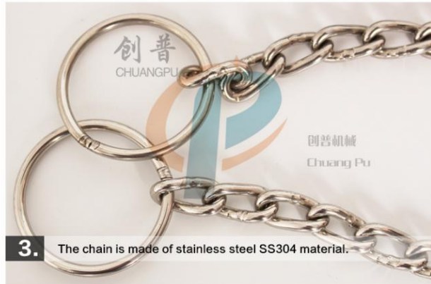
3. The chain is made of stainless steel SS304 material.