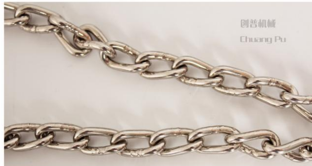
2. Seamless welded midwifery chain, stronger and more durable.