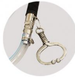
Matching iron plate spring nose pliers