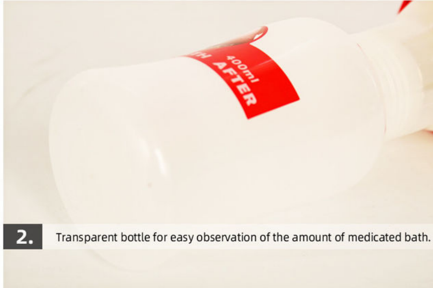
2. Transparent bottle for easy observation of the amount of medicated bath.

In summary, Chuangpu's Dairy Facility Cleaning Supplies, model HL-MP57A, are essential tools for maintaining a clean and hygienic milking environment for dairy cattle. Whether cleaning cow teats before or after milking, or ensuring the proper sanitation of milking equipment, these products are a must-have for dairy farmers looking to uphold the highest standards of cleanliness and hygiene.