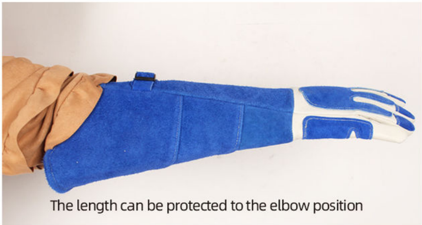
The length can be protected to the elbow position