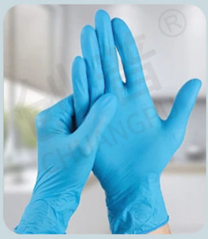
Thickened nitrile material