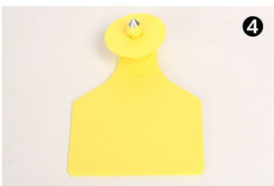
The installation is completed.