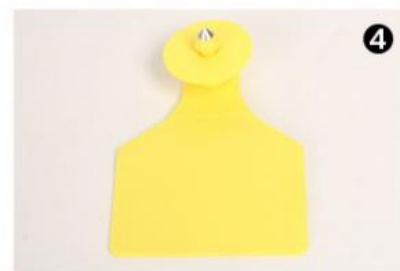
The installation is completed.