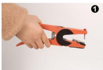
Prepare the ear tag pliers