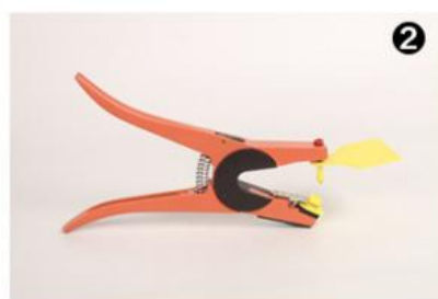
Put the ear tag into the ear tag pliers