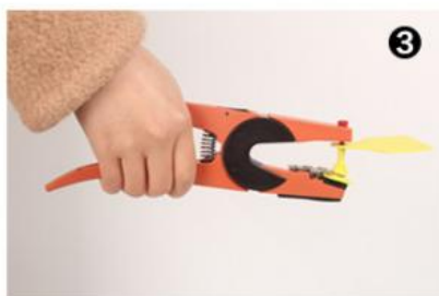
Press the ear tag pliers firmly