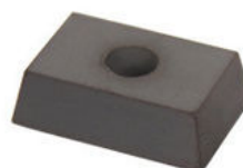
Blade for 7 Cutter Hoof Disc