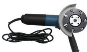
Hoof Trimming Machine with 7 cutter