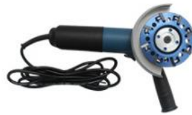
Hoof Trimming Machine with 8 cutter