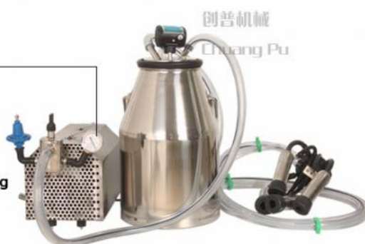
Portable milking machine use case

It can be used by installing it on the milking machine through the interface.