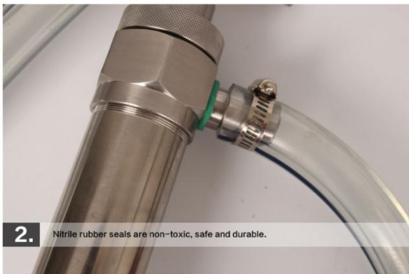
2. Nitrile rubber seals are non-toxic, safe and durable.