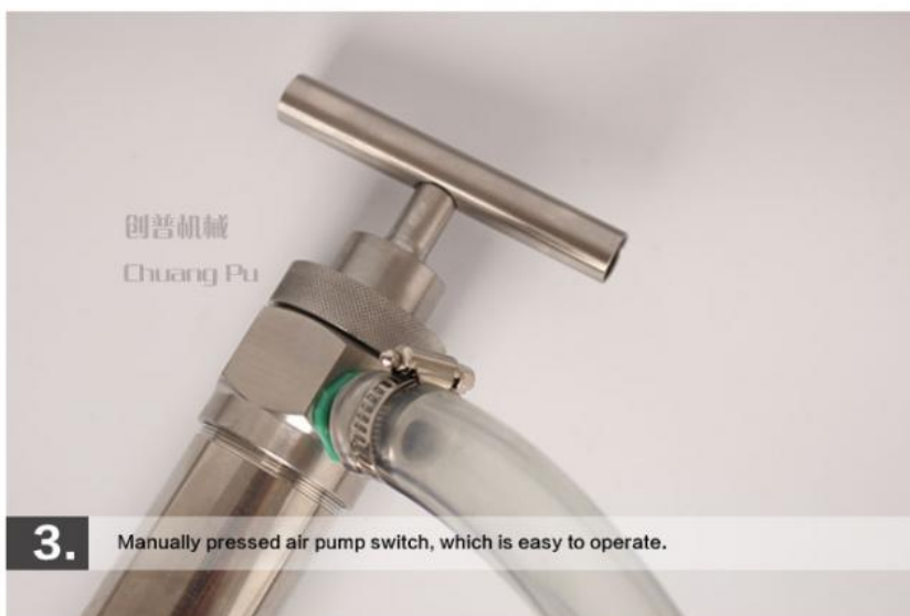
3. Manually pressed air pump switch, which is easy to operate.