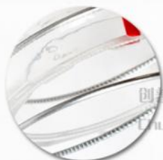
Built-in steel wire

PVC INLAID STEEL WIRE IS DURABLE AND FELXBLE