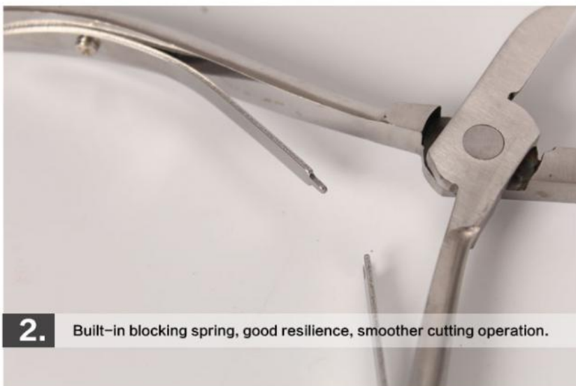
2. Built-in blocking spring, good resilience, smoother cutting operation.